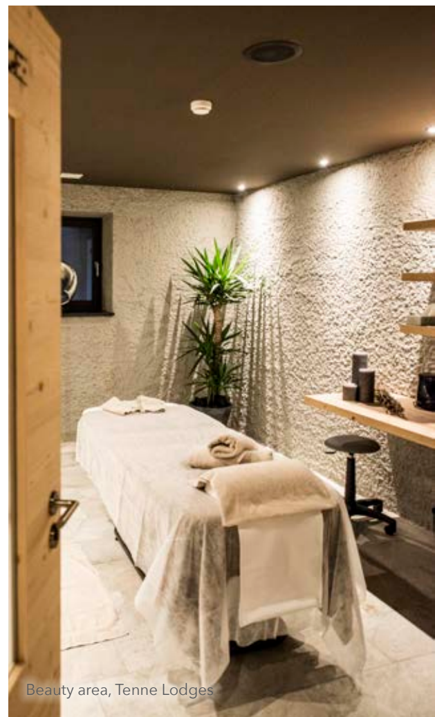
Beauty area, Tenne Lodges